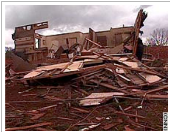
A home in Enterprise, Alabama, was destroyed Thursday when tornadoes tore through the town.